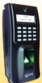
Access Control terminal